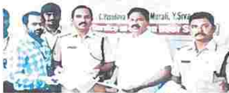
విద్యార్థులకు ఎల్ఎల్ఆర్లు ఇస్తున్న ఆర్డీవో అధికారులు