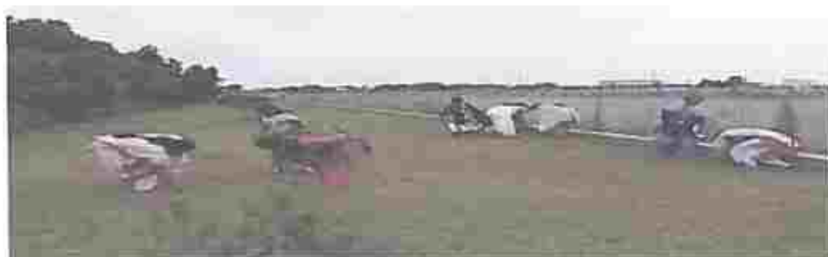
Mass Cleaning activity at college surroundings