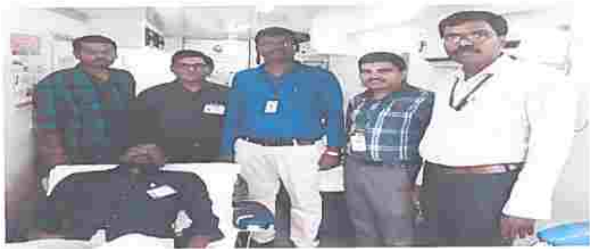
Blood donation by our Staff in the campus on

(Approved by A.I.C.T.E., New Delhi, Affiliated to JNTUA, Anantapuram)