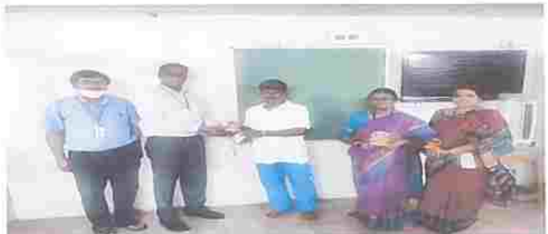
Awareness program on yoga & meditation in college by Heartfulness