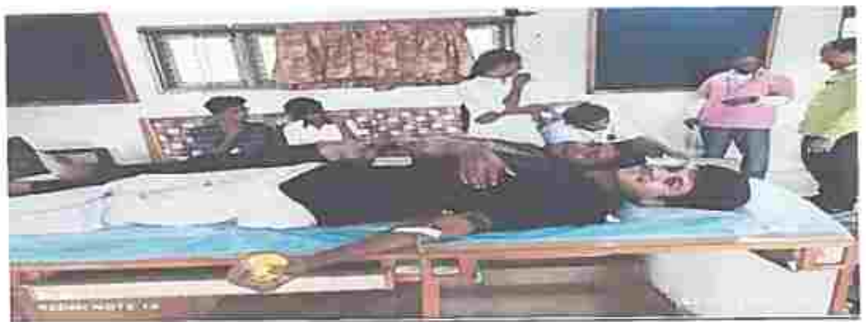
"Blood Donation & Blood Test Camp" by our NSS Volunteers