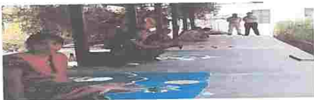
Rangoli Competition in District level Ganana bheri