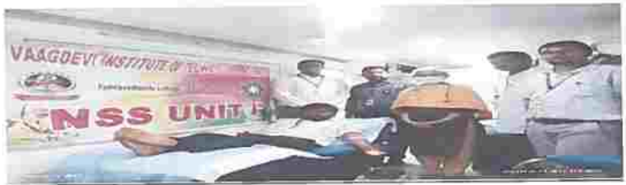
"Blood Donation & Blood Test Camp" by our Staff Member

The NSS volunteers played a vital role in making this camp success with their dedication in serving people ,they directed people in all needy way