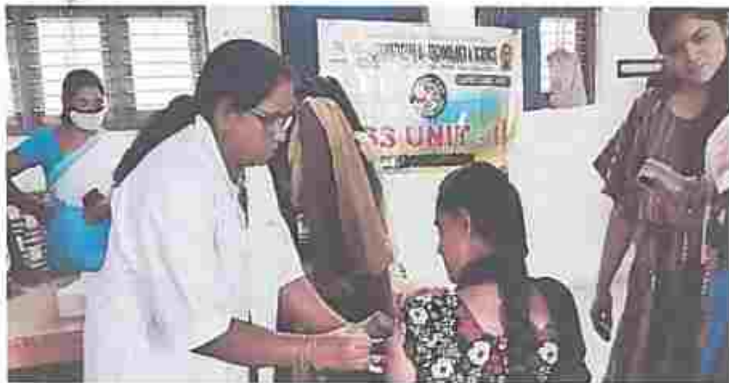
"Booster Dose" by Asha Workers in our college premises on 22-07-2022

The NSS volunteers played a vital role in making this camp success with their dedication in serving people ,they directed people in all needy way.