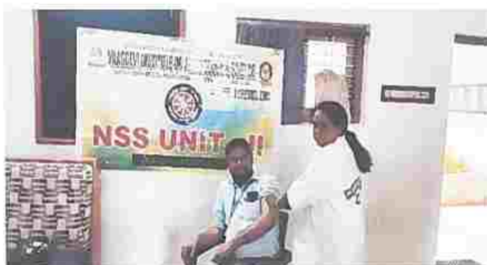
COVID(BOOSTER DOSE) Vaccination For Students And Staff In The Campus by Asha Workers in our college premises