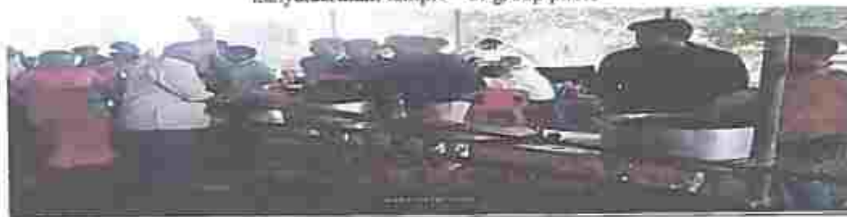
food distribution by our NSS Volunteers