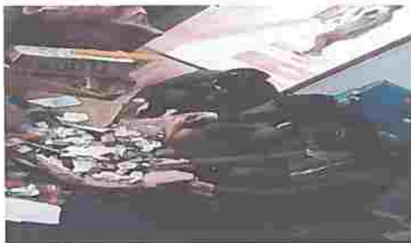
Mass Cleaning activity at college in all places.

The NSS volunteers played a vital role in making this camp success with their dedication in serving people, they directed people in all needy way