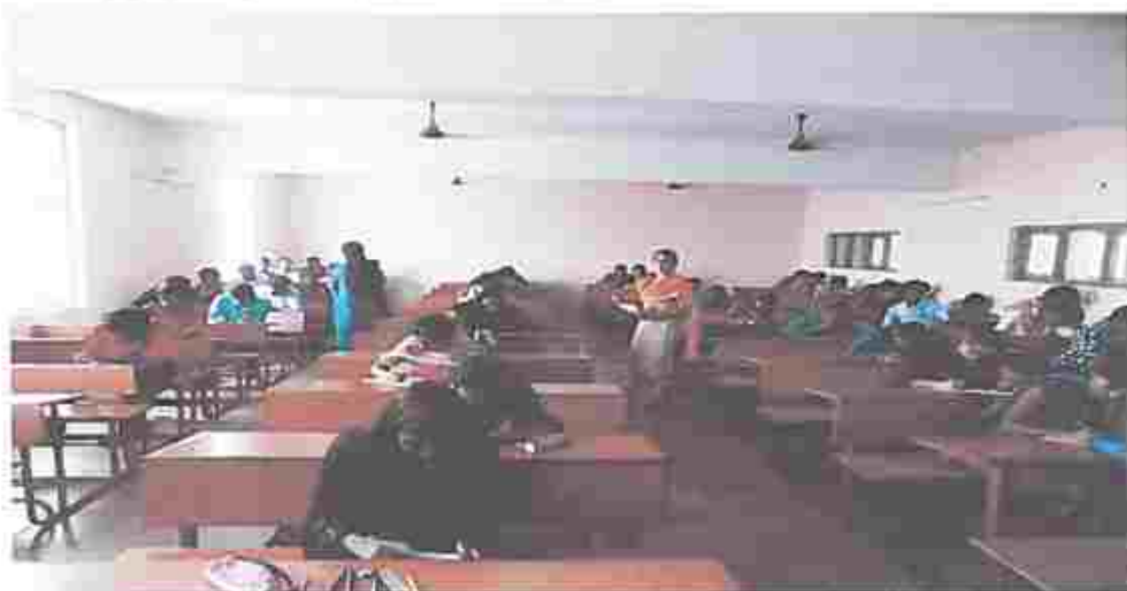
Essay Writing Competition in our college

The NSS volunteers played a vital role in making this camp success with their dedication in serving people they directed people in all needy way