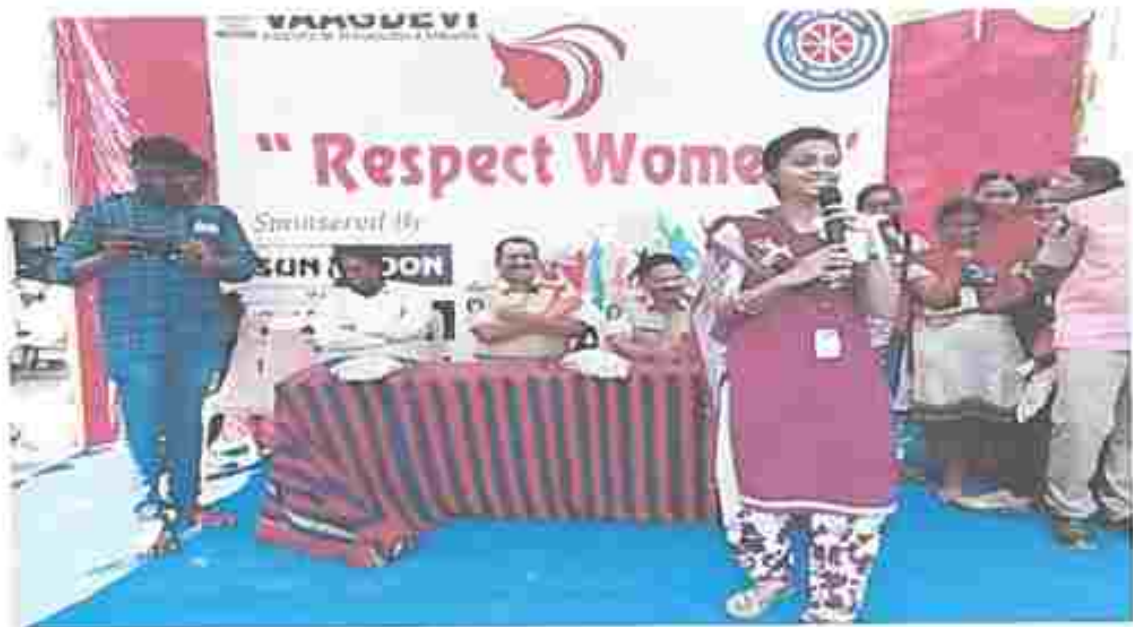
Our College Student and NSS Volunteer speaking a few words on how to respect women at puttaparthy circle in proddatur town

(Approved by A.I.C.T.E., New Delhi. Affiliated to JNTUA, Anantapuram)