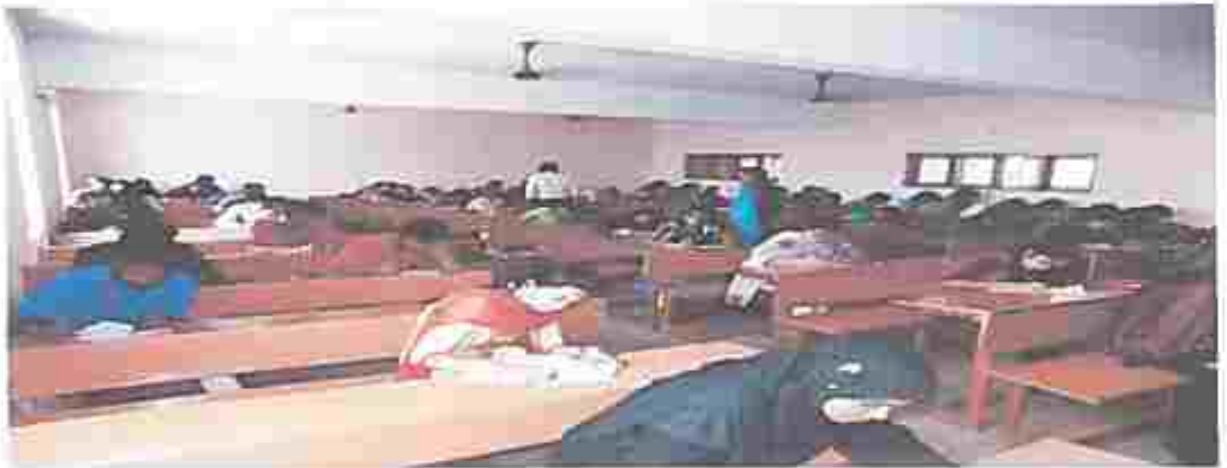
Elucution Writing Competition in our college

(Approved by A.I.C.T.E., New Delhi, Affiliated to JNTUA, Anantapuram)