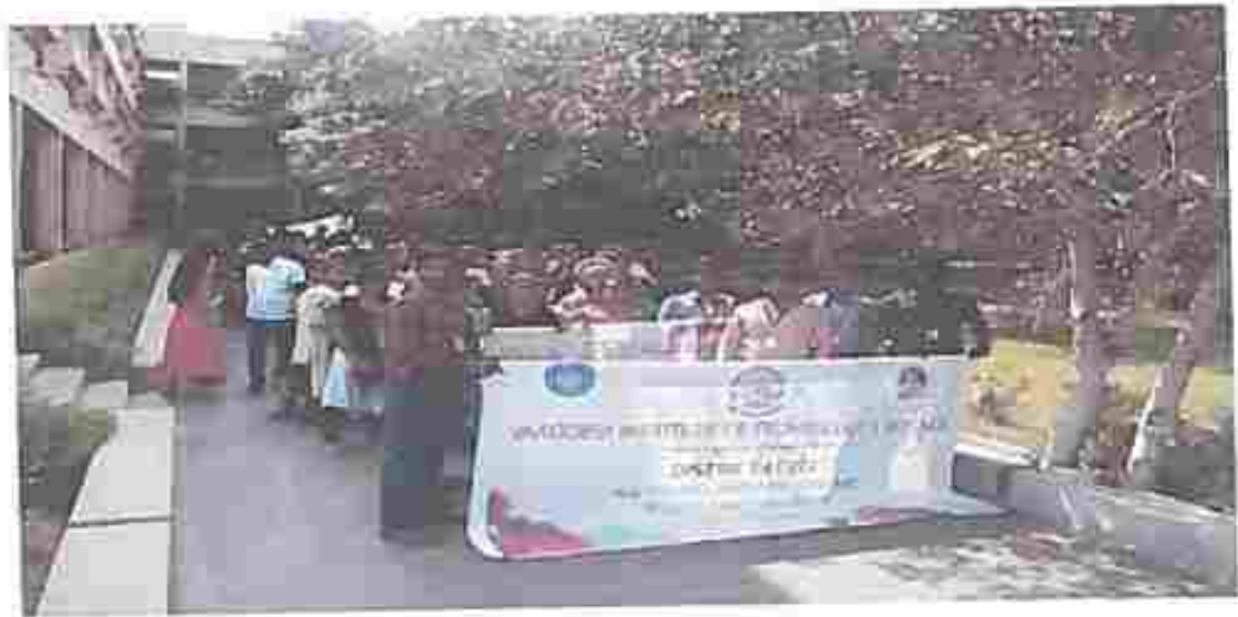
District level Ganana bheri by the JNTUA University at our college

The NSS volunteers played a vital role in making this camp success with their dedication in serving people they directed people in all needy way