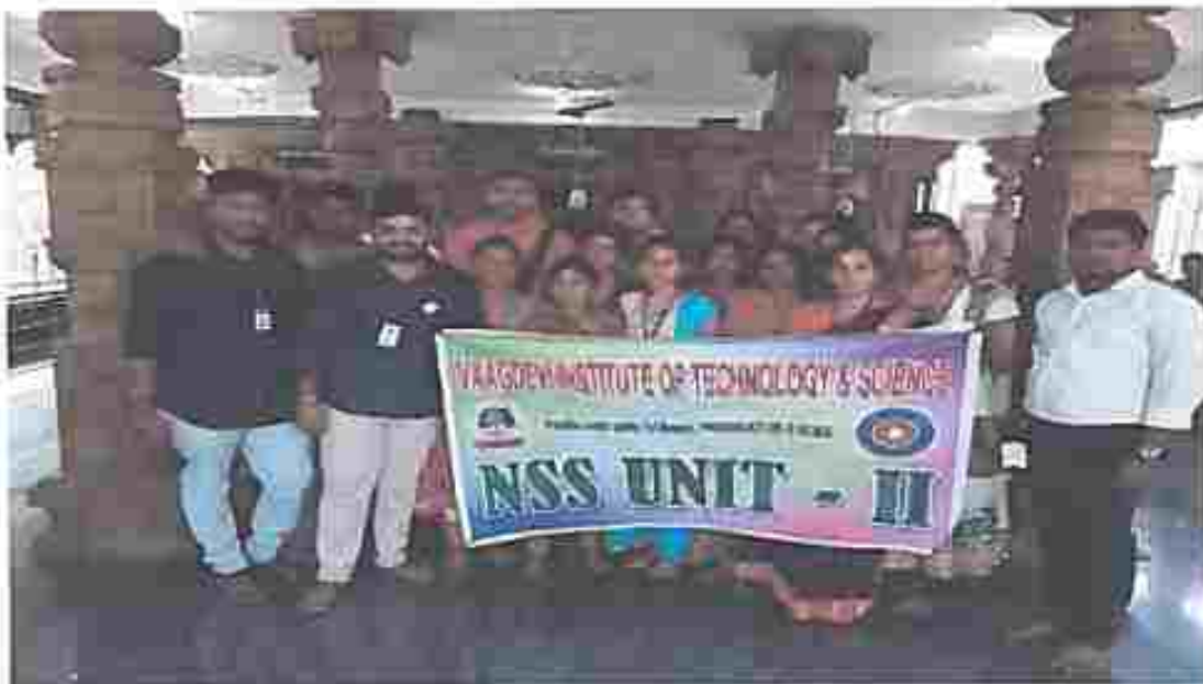
Group Photo of our NSS volunteers in kanyateertham temple

The NSS volunteers played a vital role in making this camp success with their dedication inserving people, they directed people in all needy way.