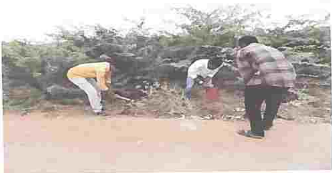
*NSS Volunteers actively participated in Swachh Bharat at Kothapalle Village