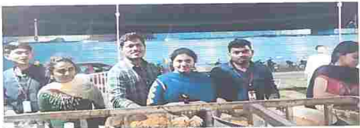
Students are Participated in Food distribution