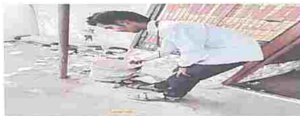
Cleaning the papers by student in College Surrounding Areas