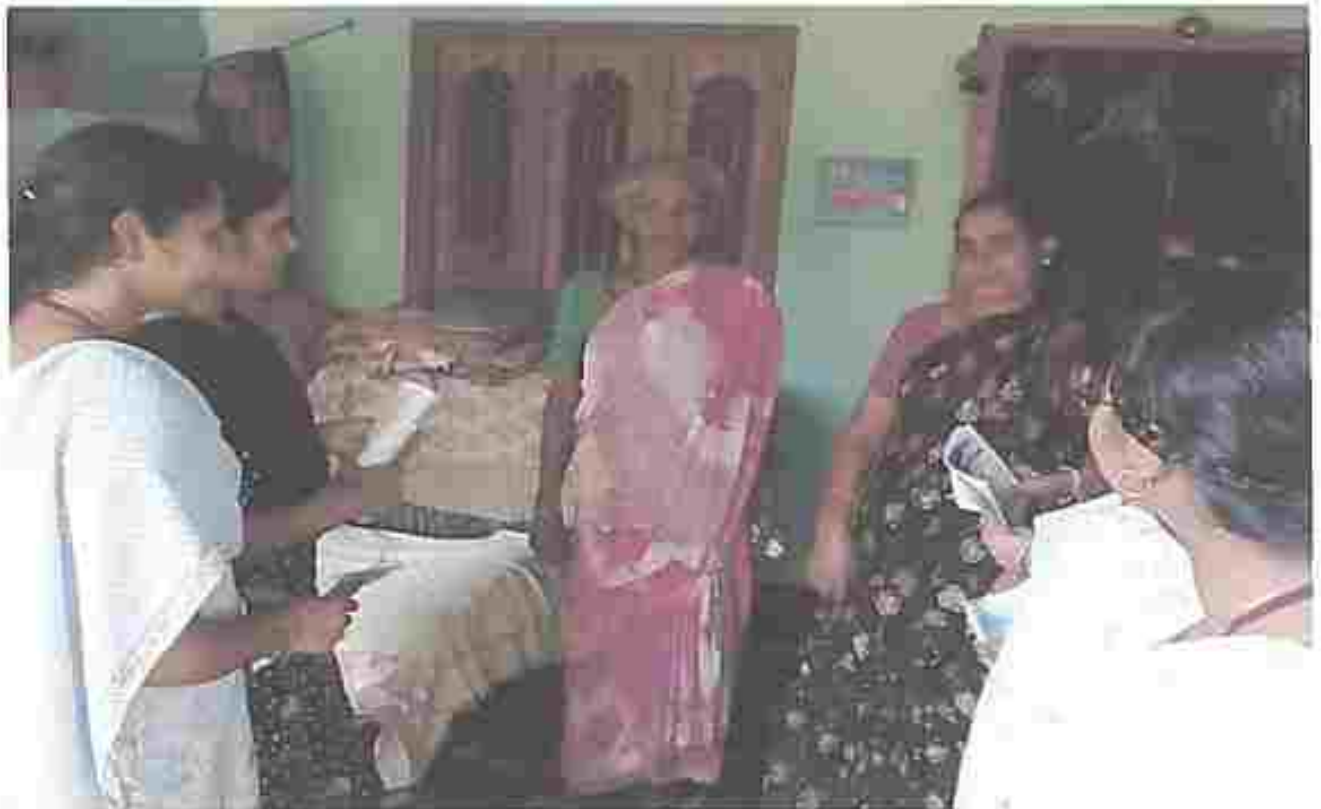
Giving awareness on fever to the villagers

The NSS volunteers played a vital role in making this camp success with their dedication in serving people, they directed people in all needy way.