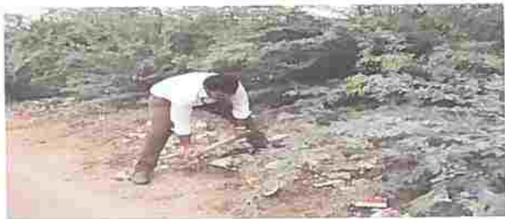
Clenning program done on Republic day in Narasimbapuram