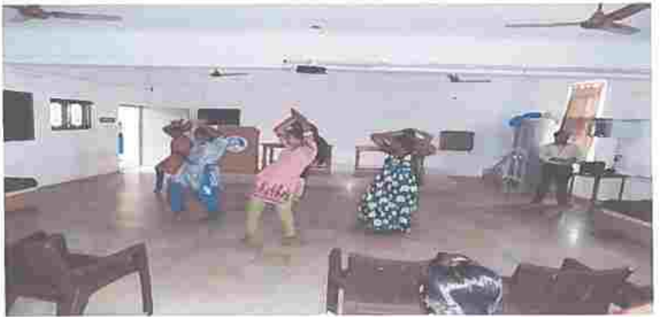
Dance Competition in our college