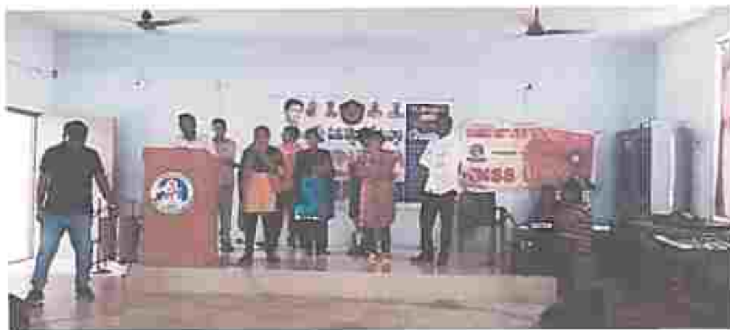
Speech given by Students in Awareness program

ఆంధ్రప్రదేశ్ ఆంధ్ర ప్రదేశ్ సాహిత్య పత్రిక