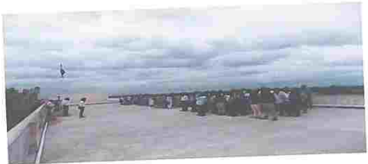
Independence day Celebrations at Vaagdevi institute of technology & Science

The NSS volunteers played a vital role in making this camp success with their dedication in serving people, they directed people in all needy way.