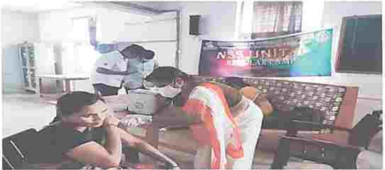
Corona Vaccination Faculty were Vaccinated with the help of ANM's

Approved by A.I.C.T.E., New Delhi. Affiliated to JNTUA, Anantapuramu