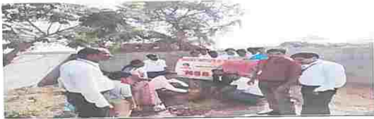
Tree Plantation by Principal SD Govardhan on occasion of "Republic day "