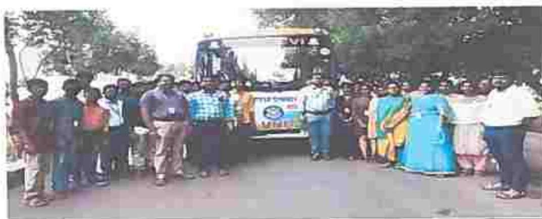
"NSS program on "Crowd Mangement of our volunteers during karthika pournami in kanyateertham temple" of group photo

The NSS volunteers played a vital role in making this camp success with their dedication in serving people, they directed people in all needy way