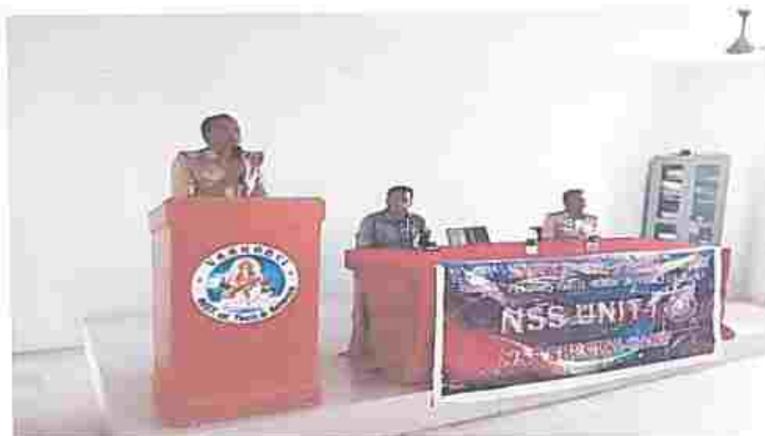
Speech given by Drug inspector

The NSS volunteers played a vital role in making this camp success with their dedication in serving people they directed people in all needy way.