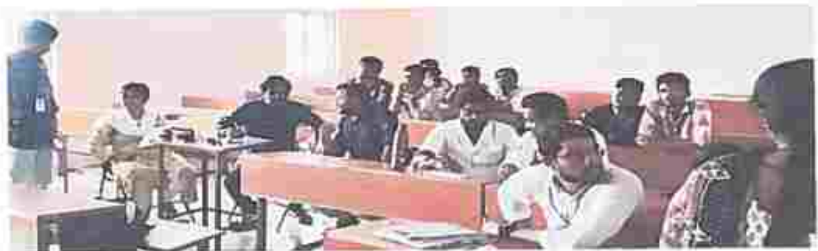
Students participating in Free medical eye Camp