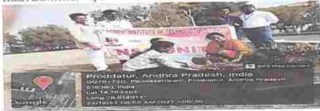
Tree plantation by our students