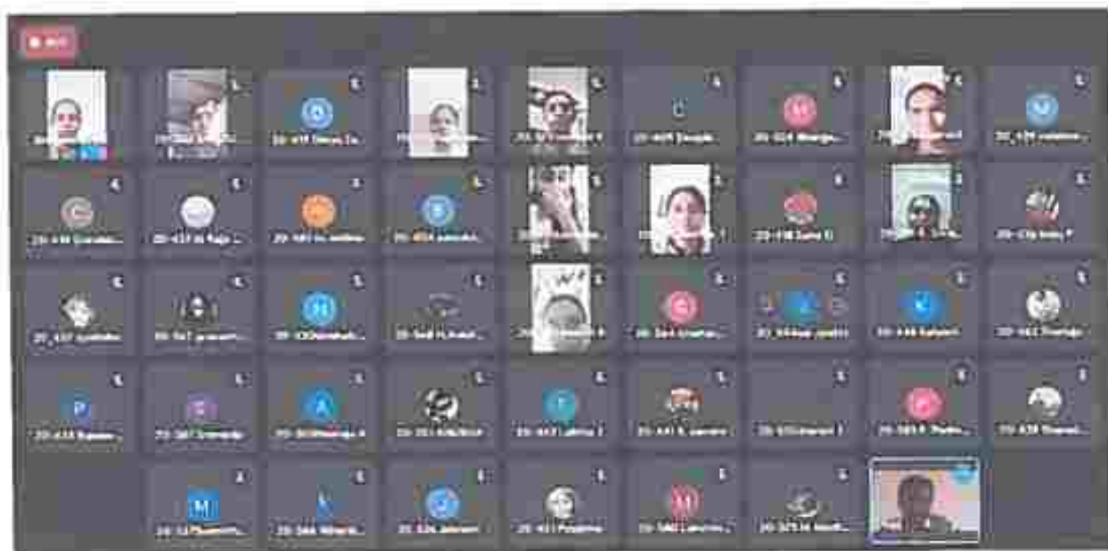
Screen Shot of the Webinar with Participants

The NSS volunteers played a vital role in making this camp success with their dedication in serving people, they directed people in all needy way