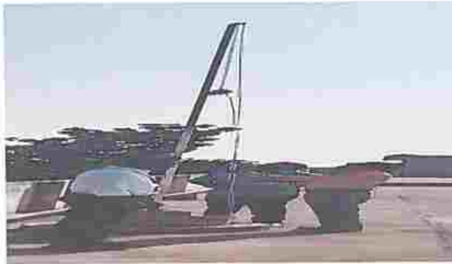
Republic day celebration at College

The NSS volunteers played a vital role in making this camp success with their dedication in serving people; they directed people in all needy way .