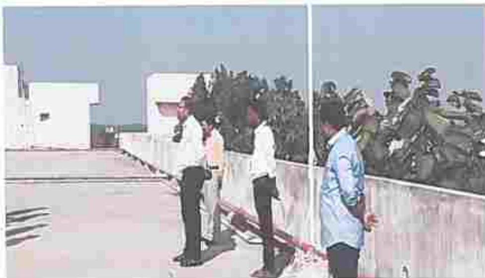
Speech given by Staff on Republic day celebration at College