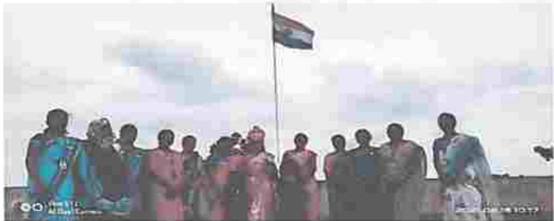
Group Photo of Ladies staff After Flag hosting.

The NSS volunteers played a vital role in making this camp success with their dedication in serving people, they directed people in all needy way