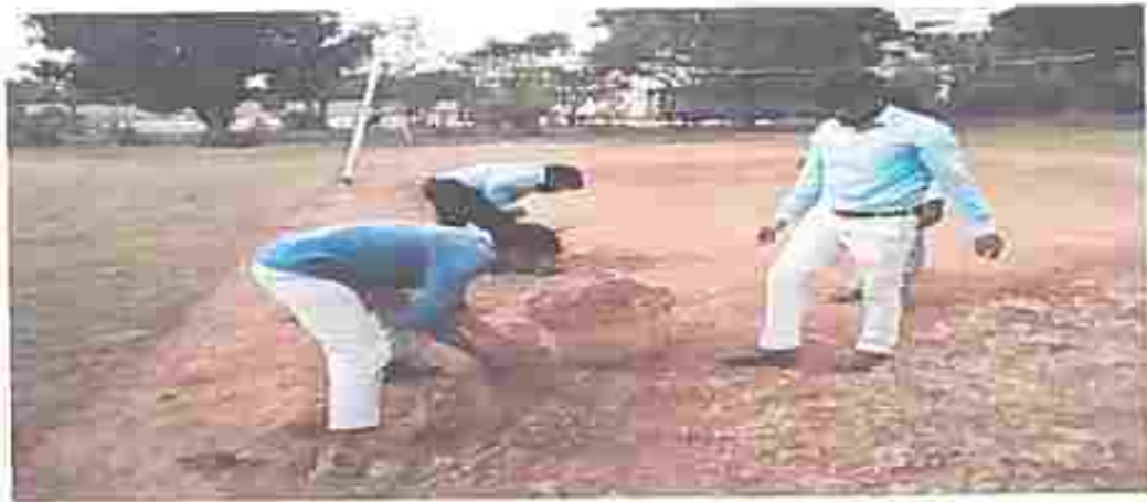
Cleaning program don on Republic day in College Surrounding

(Approved by A.L.C.T.E., New Delhi, Affiliated to JNTUA, Anantapuramu)