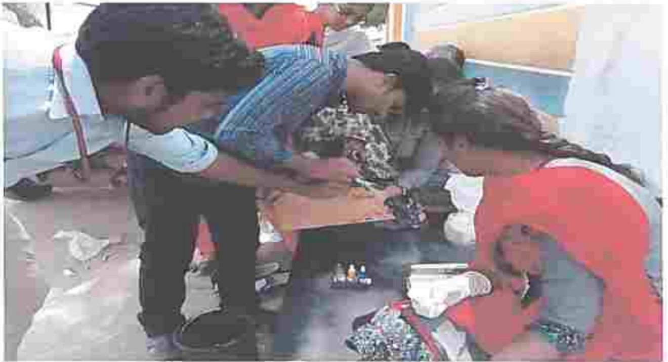
Blood Grouping and Hemoglobin test by NSS Volunteers

The NSS volunteers played a vital role in making this camp success with their dedication inserving people, they directed people in all needy way.