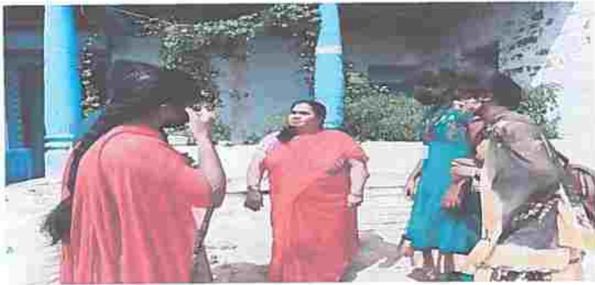
Students making Awareness preventive measures to over come Covid

The NSS volunteers played a vital role in making this camp success with their dedication in serving people ,they directed people in all needy way