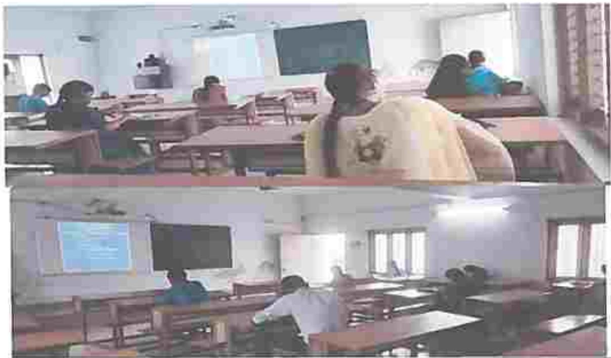
Essay Writing Competition on 11-08-2022 on the occasion of Independence day & HargharThiranga 2022

The NSS volunteers played a vital role in making this camp success with their dedication in serving people, they directed people in all needy way