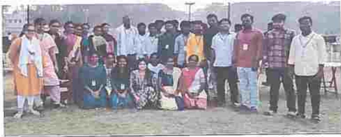
Staff & Students are participated in "SRI VENKATESWARA KALYANAM"

The NSS volunteers played a vital role in making this camp success with their dedication in serving people, they directed people in all needy way