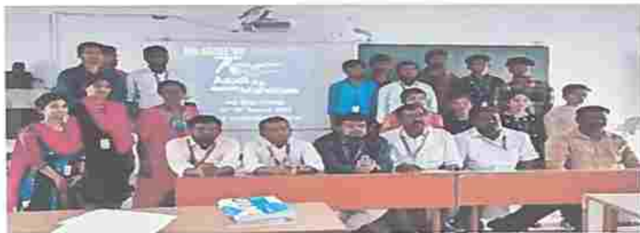
Extempore Speech Competition on the occasion of Independence day & Harghar Thiranga