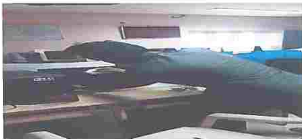
Mass Cleaning activity at college in all places