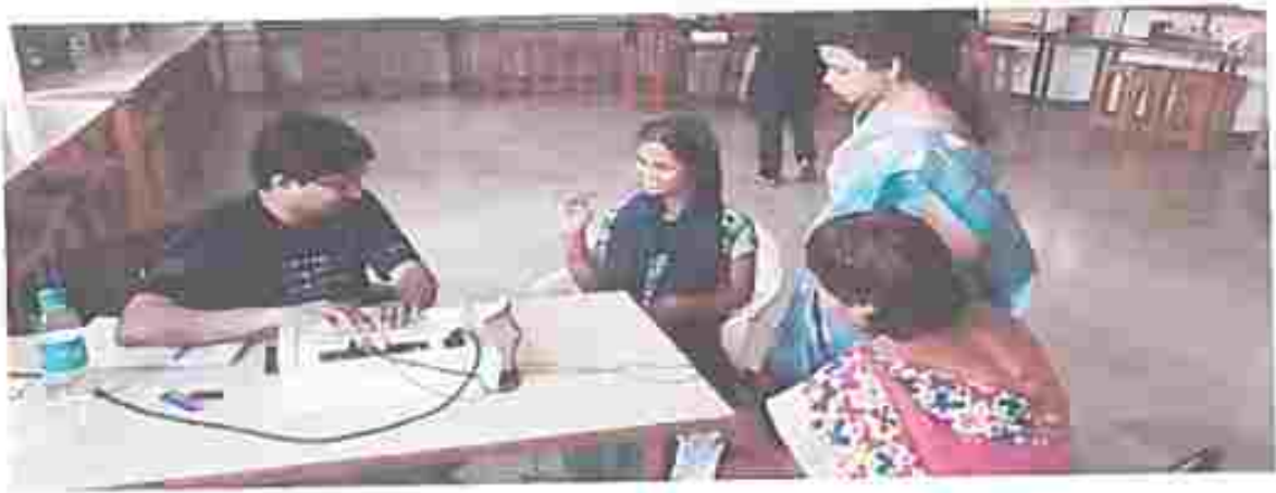
Doctor testing the patient in the camp