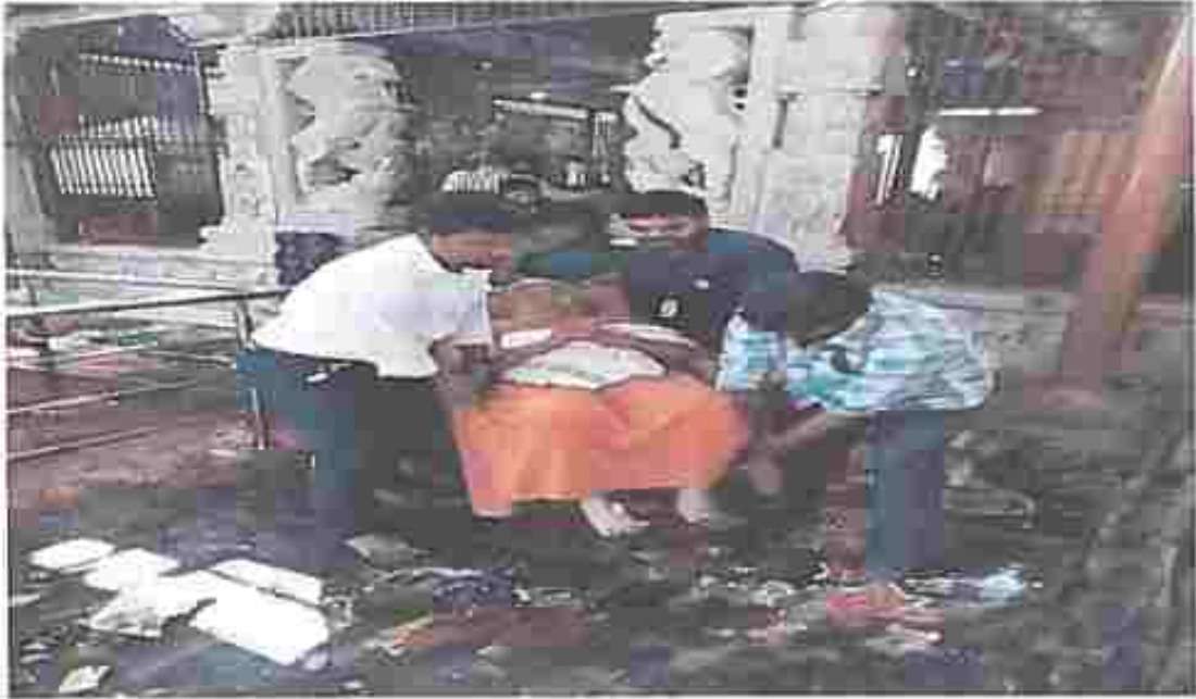
Our NSS volunteers were helping for senior citizens

(Approved by A.I.C.T.E., New Delhi, Affiliated to JNTUA, Anantapuramu)