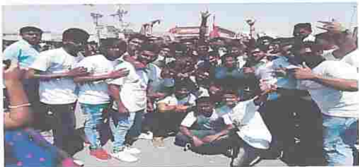
Our College Students and NSS Volunteers participate in FLASH MOB on how to "Respect Women" at puttaparthy circle in proddatur town