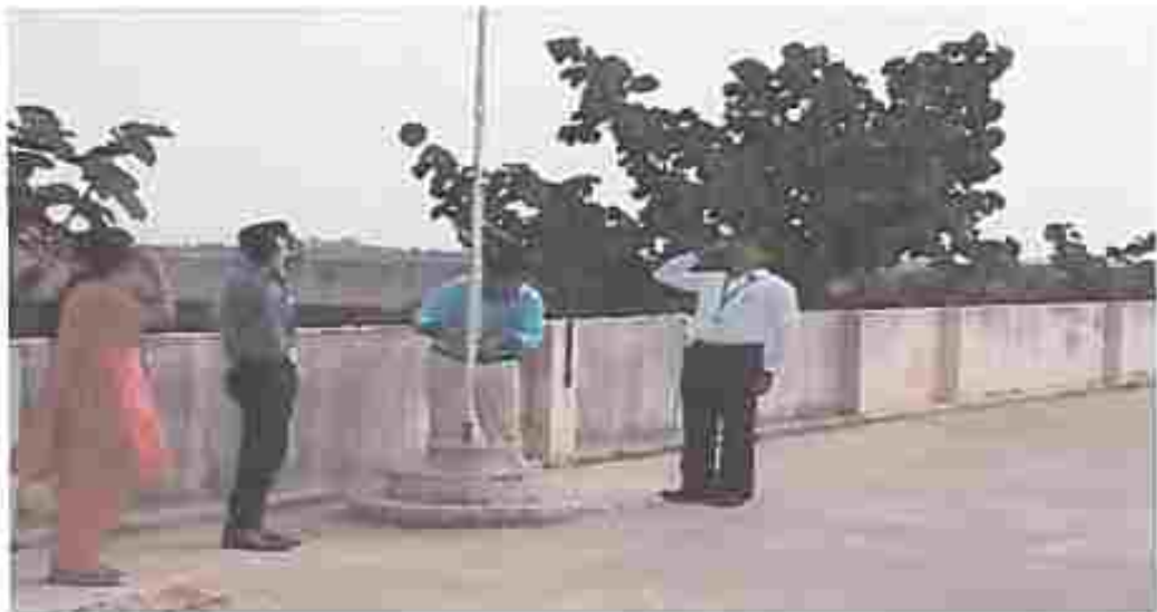
"Republic day celebration" in Our college

The NSS volunteers played a vital role in making this camp success with their dedication in serving people; they directed people in all needy way