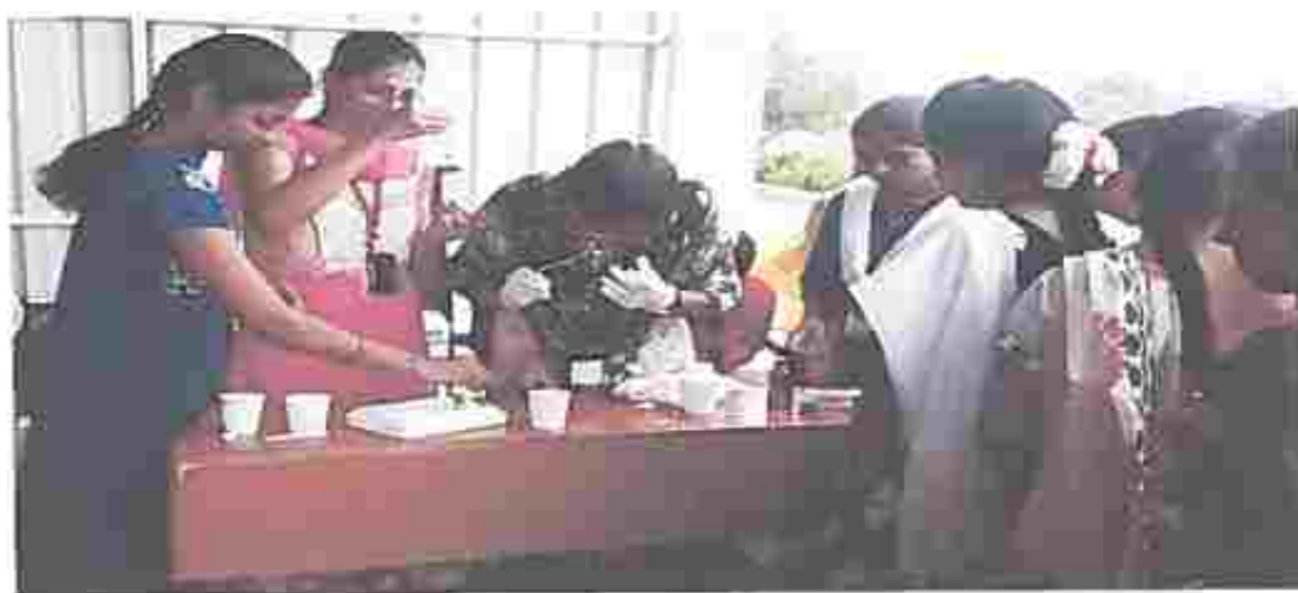
Blood Grouping and Hemoglobin levels checking by NSS Volunteers from both units

The NSS volunteers played a vital role in making this camp success with their dedication in serving people, they directed people in all needy way