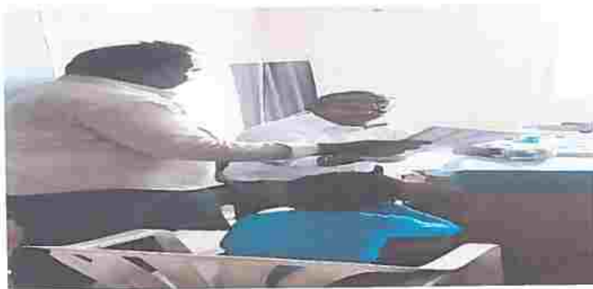
Doctor testing the patient