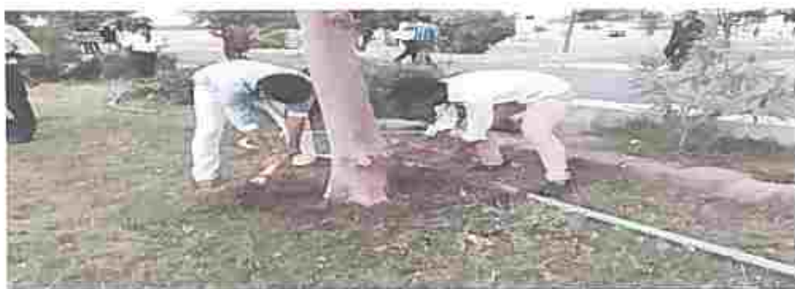
Massive Cleaning activity at college surroundings

The NSS volunteers played a vital role in making this camp success with their dedication in serving people ,they directed people in all needy way