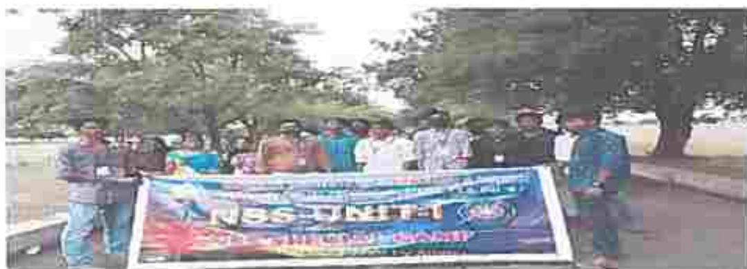
Clean India program camp

The NSS volunteers played a vital role in making this camp success with their dedication in serving people, they directed people in all needy way.