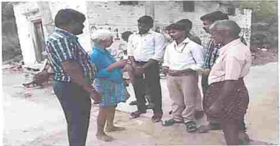
Educating Villages about the importunes of cleaning of their surroundings

(Approved by A.I.C.T.E., New Delhi, Affiliated to JNTUA, Anantapuram)