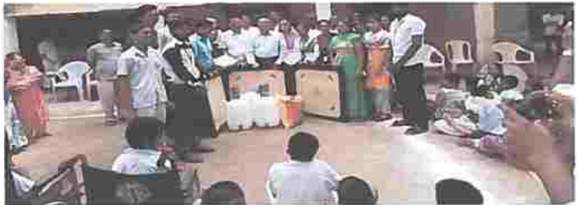
Distribution of necessities to the VIKAS VIHAR SCHOOL

The NSS volunteers played a vital role in making this camp success with their dedication inserving people, they directed people in all needy way.