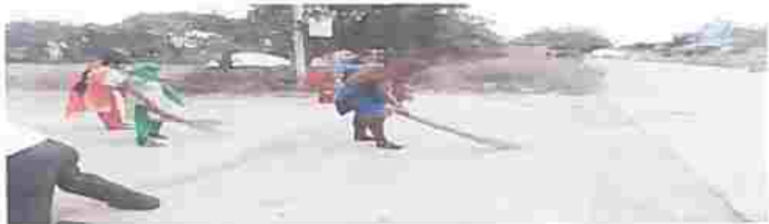
NSS students clearing roads on Republic day in near villages