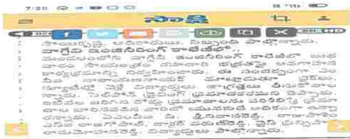
News report of SWACHATHA PAKWADA camp