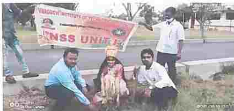
Planting trees on the occasion of "independence day", at Narasimhapuram