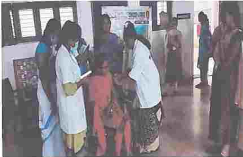
COVID(BOOSTER DOSE) Vaccination For Students And Staff In The Campus "Booster Dose" by Asha Workers in our college premises

(Approved by A.I.C.T.E., New Delhi, Affiliated to JNTUA, Anantapuram)