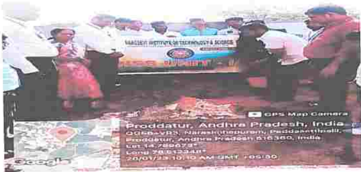
Tree Plantation by Panchayath secretary on occasion of "Republic day "

(Approved by AICTE, New Delhi, Affiliated to JNTUA, Anantapuramu)