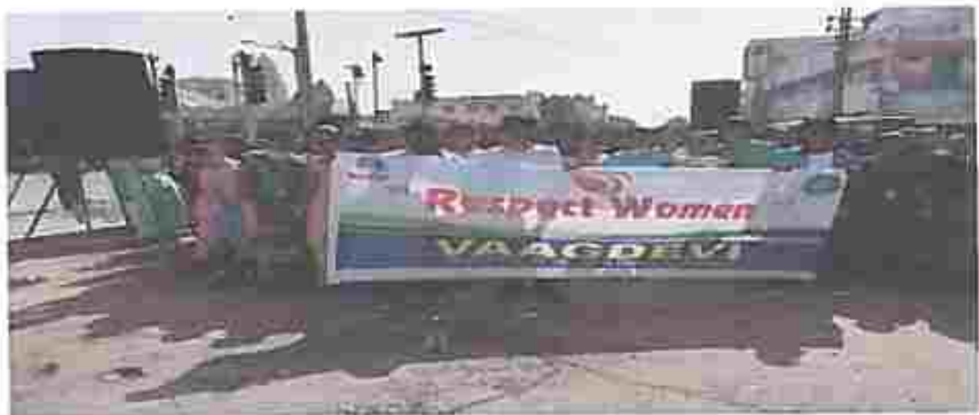
Students participated in Rally on "RESPECT WOMEN" from Municipal high school to puttaparathi circle inproddatur

The NSS volunteers played a vital role in making this camp success with their dedication in serving people, they directed people in all needy way.