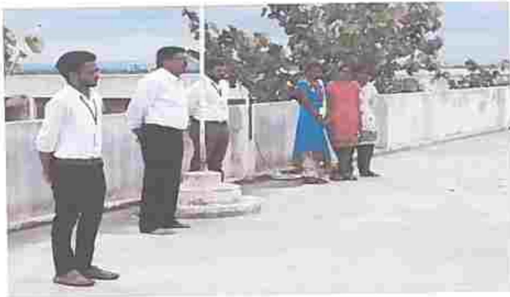
Patriotic Speech by our Principal

(Approved by A.I.C.T.E., New Delhi, Affiliated to JNTUA, Anantapuramu)