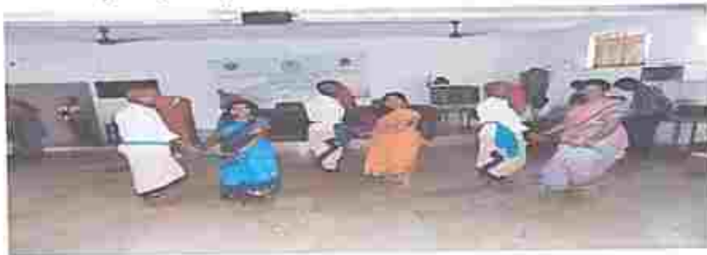
Cultural activity in District level Ganana bheri