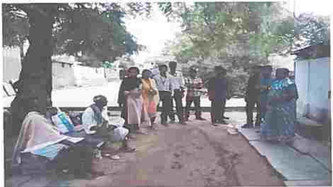
Educating Villages about the importunes of cleaning of there surroundings