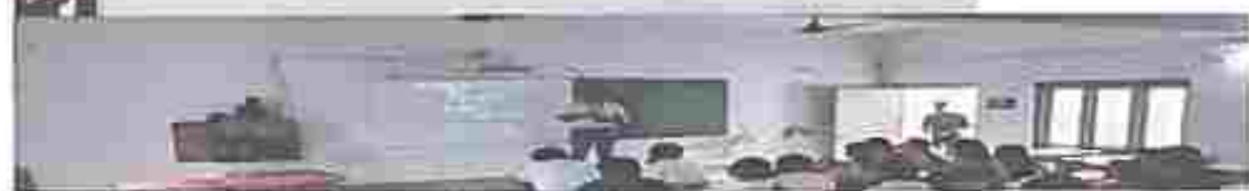
Extempore Speech Competition on the occasion of Independence day & Harghar Thiranga