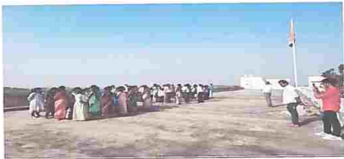
Address by principal on the occasion of republic day after flag hoisting

The NSS volunteers played a vital role in making this camp success with their dedication in serving people .they directed people in all needy way .