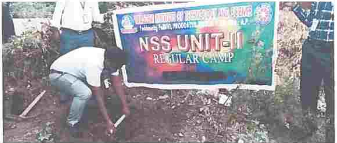
Sapling Plantation Program during Republic day program

(Approved by A.I.C.T.E., New Delhi, Affiliated to JNTUA, Anantapuramu)