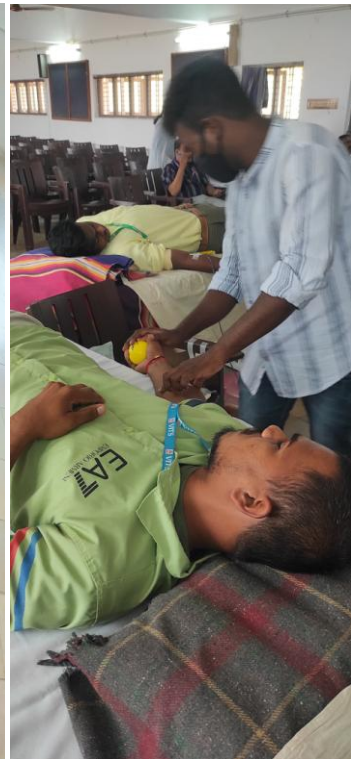
Our Faculty & Students actively participating in Blood donation